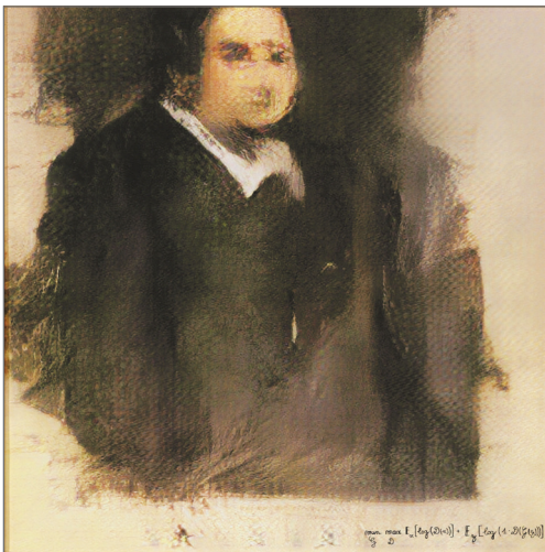
Edmond de Belamy painting. Download here (Public Domain): https://en.wikipedia.org/wiki/Edmond_de_Belamy#/media/ File:Edmond_de_Belamy.png

There is no doubt that in this case Computational Aesthetics help us improve understanding of human aesthetic perception. Because when intelligent machines start generating their own designs and art pieces, free from our aesthetic constraints, how are we as human beings going to be able to understand their own original outcomes? Are we ready to adapt and fall in love with non-anthropocentric forms of creativity?