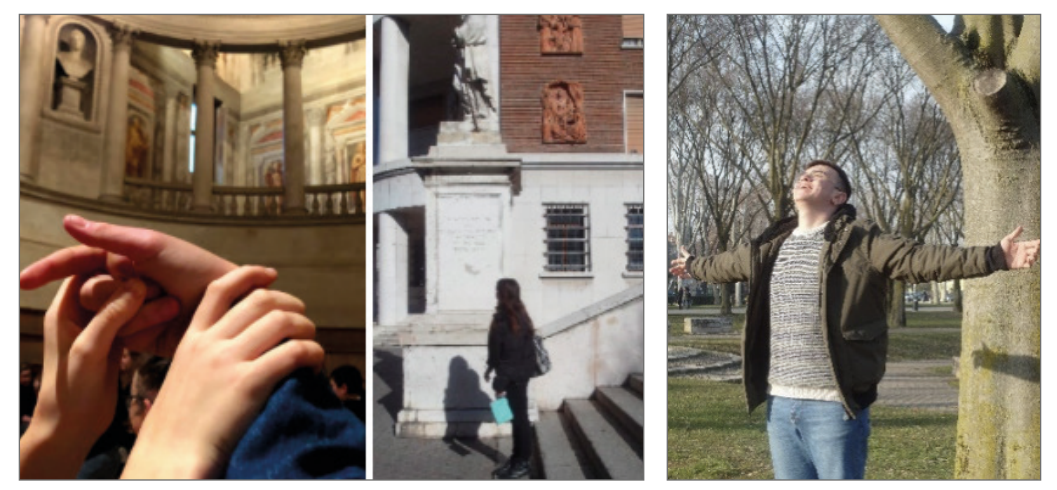
fig.2- Images from the workshop: playing with the statue and the sculptor; observing the shadow; greet the city and express a gesture of gratitude. Credit: 1. Alessandra De Nicola, 2/3 Giulia Schiavone.

A notebook of suggestions and activity proposals left as a gift to each user of the kit (see fig. 3, 4) make visible the results of this type of approach.