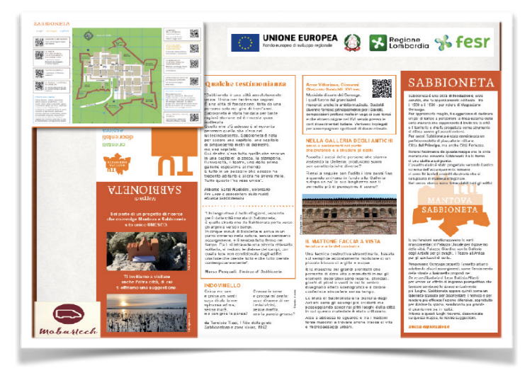
Fig. 1- The map of Sabbioneta, with interactive stories by community, architectural and musical tools

The first stage of the journey was to bring out the public's gaze through two different approaches, one autobiographical (Cambi, Demetrio, Mancino) and the other interpretative (Tilden, Hooper Greenhil, Volli). Concerning the first approach, we worked on the personal experience: with interviews, maps and stories through images, thanks to which we built a mosaic of autobiographical content that allowed us to identify the really significant elements for the different communities. The tool of the kit that best sums up this process visually are the maps of the two cities (see fig 1). As far as the interpretative approach is concerned, we worked in a laboratory way, proposing activities of: sound landscape education with the musician Federica Furlani, body exploration with the pedagogist and performing arts expert Giulia Schiavone and architectural exploration with the architect Patrizia Berera. In this case we had a twofold objective: to check out some of the proposals for activities that formed part of the kit; to research the points of view of the public through unusual approaches to cultural heritage.