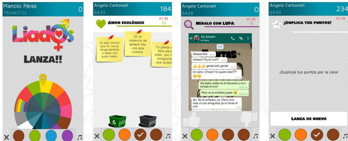
Figure 1. Images of the Liad@s app being played, showing various tests.

aspects to encourage the game dynamic (double, lose, save points), strengthening the player's connection with the intervention and ensuring consistent use of the game.