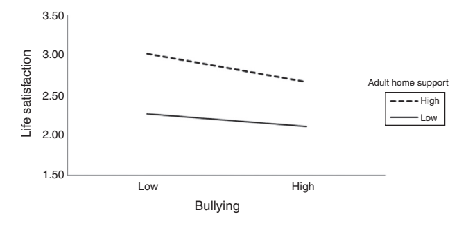
Figure 1. Regression and interaction of 'life satisfaction' and 'adult home support' by bullying level.