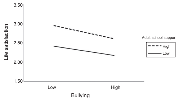
Figure 2. Regression and interaction of 'life satisfaction' and 'adult school support' by bullying level.

for life satisfaction , \beta = -.09, p < .05 . In this model, bullying is not significant, \beta = .15, p > .05 , but the perception of adult school supports was significant, \beta = .31, p < .01 . Both models 2 and 3 contributed to 16% of explained variance.